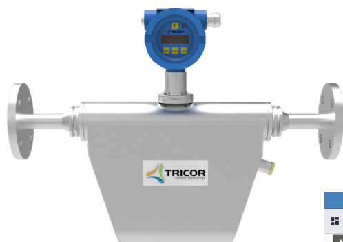
TRICOR TCM 028K

As part of the Flow Division of TASI Group, AW-Lake is connected to SignalFire, a leading provider of wireless telemetry solutions. This connection enables AW-Lake to design and deliver comprehensive flow measurement and control solutions that include wireless communications.