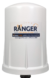
SignalFire RANGER Wireless Transmitter