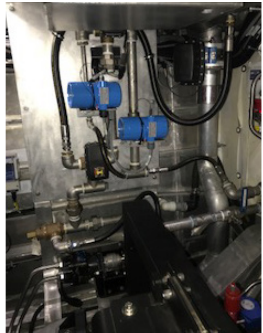
The very small footprint of the AW-Lake Turbine Flow Meters met the installation challenge posed by the limited space of the bottom deck of the fire boats.

The AZBIL Magmeter measures the river water/foam mixture's flow rate up to 5,000 GPM. The water mixture then flows through two high-pressure spray nozzles positioned at the front of the boats at a rate of 500 to 600 GPM to achieve a desired spray height of approximately 500 feet to extinguish a fire.